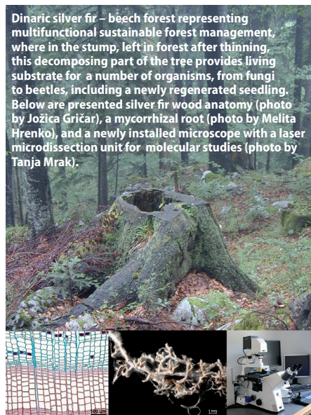
Dinaric silver fir – beech forest representing multifunctional sustainable forest management, where in the stump, left in forest after thinning, this decomposing part of the tree provides living substrate for a number of organisms, from fungi to beetles, including a newly regenerated seedling. Below are presented silver fir wood anatomy, a mycorrhizal root, and a newly installed microscope with a laser microdissection unit for molecular studies.